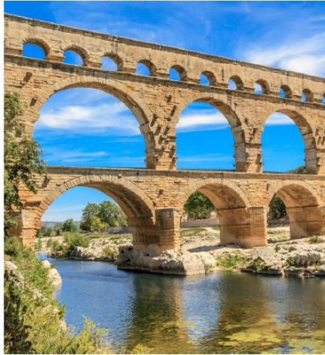
Pont du Gard, Avignon, France